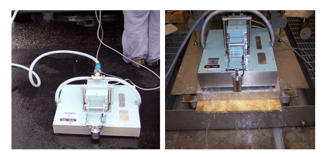
Figure 3 Field Testing