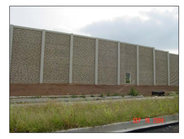
MD 216 bifurcated roadway