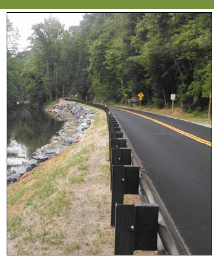
Corman Construction was the contractor for MSHA's first CMAR -MD 24 – Deer Creek Project

Corman understands this is the second Construction Management at Risk (CMAR) project for MSHA and success will be gained by a solid collaboration that fosters teamwork, respect for the historic nature of the surrounding area, minimizing impacts to the environment and finding the best cost-effective solutions given the site constraints. As the successful Contractor on the State's first CMAR we hope to build on the success and relationships built on that project. The CMAR contracting process anticipates a contract duration less than traditional design-bid-build and design-build with equal risk between Owner and Contractor. The goal is to reach an agreeable Guaranteed Maximum Price (GMP) among our team with concurrence from an Independent Cost Engineer (ICE) to proceed to construction with a fair market price GMP. Preconstruction services include constructability analysis, value engineering, scheduling, site assessments and cost estimating with input to the MSHA and its Designer from the Contractor through each phase.