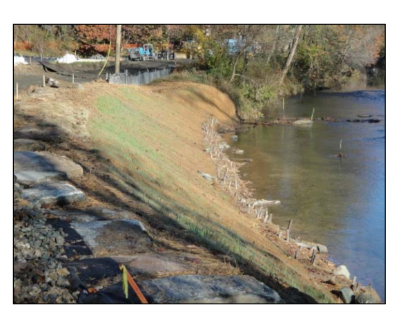
CMAR MD 24 replanted slope