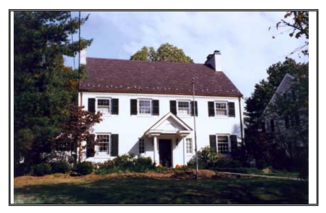
Plate 12: Colonial Revival (3945 Linnean Avenue, Forest Hills, Washington, D.C.)