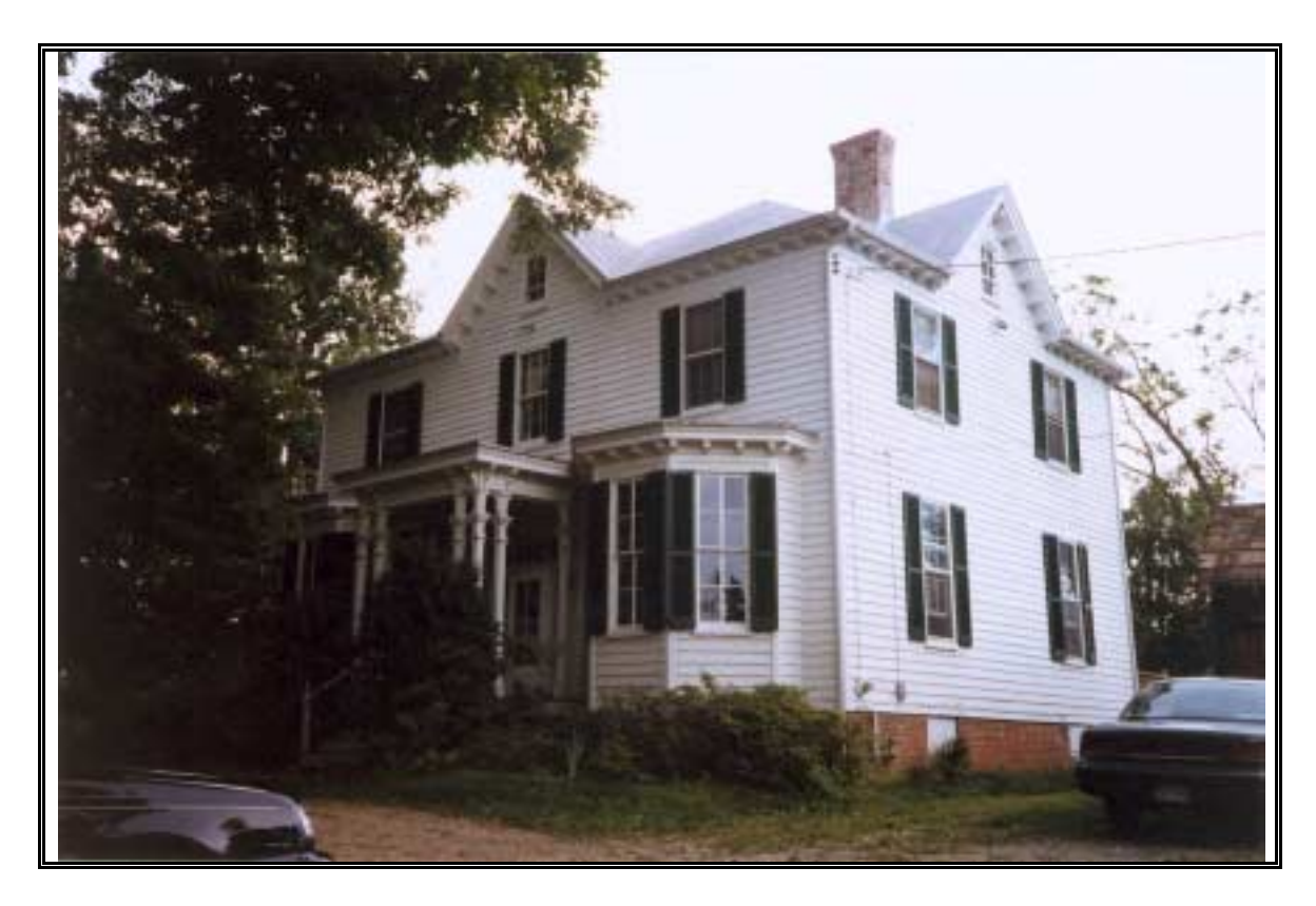
Plate 8: Italianate (16109 Marlboro Pike, Upper Marlboro, Prince George's County)