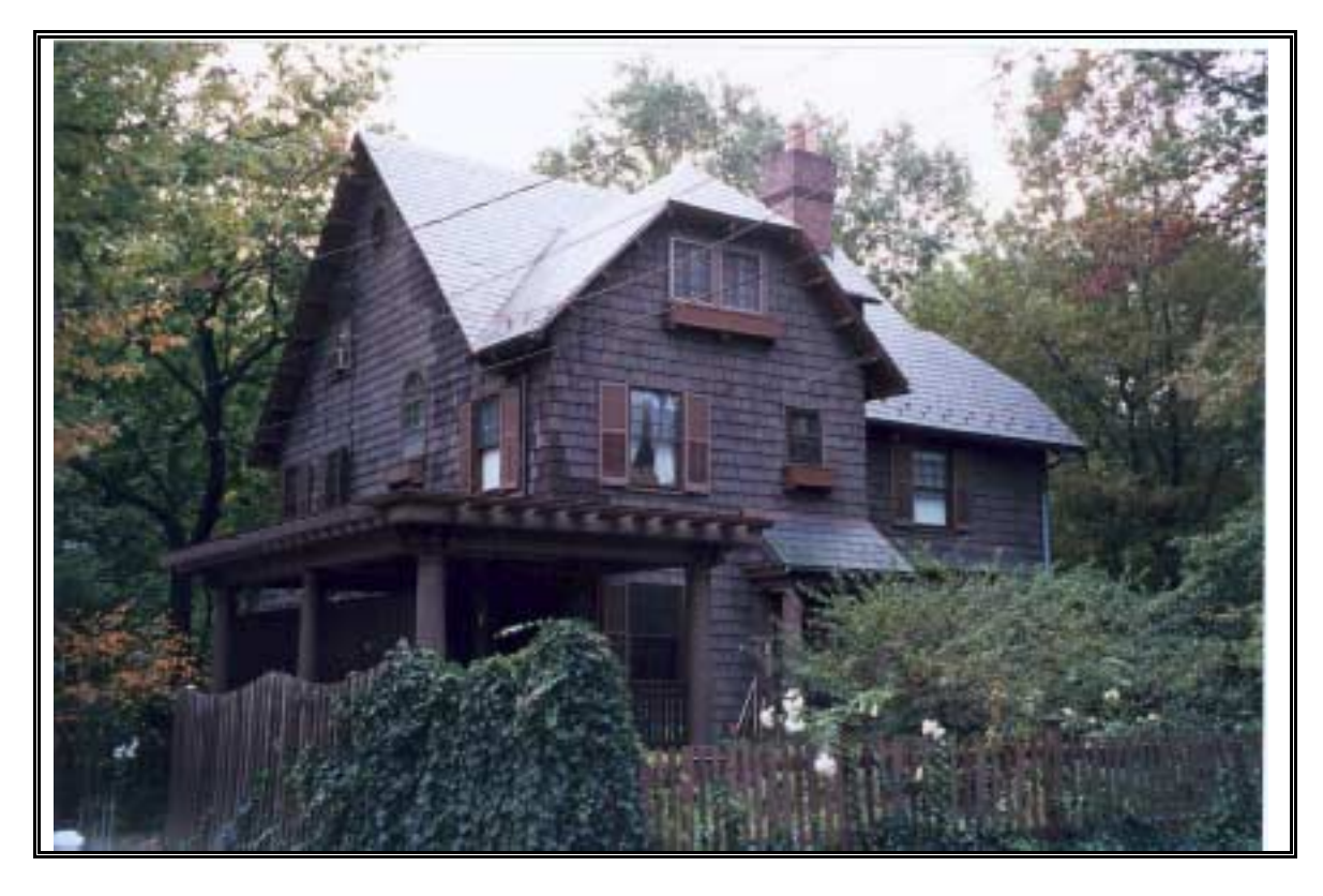
Plate 10: Shingle (3300 block of Newark Avenue, Cleveland Park, Washington, D.C.)