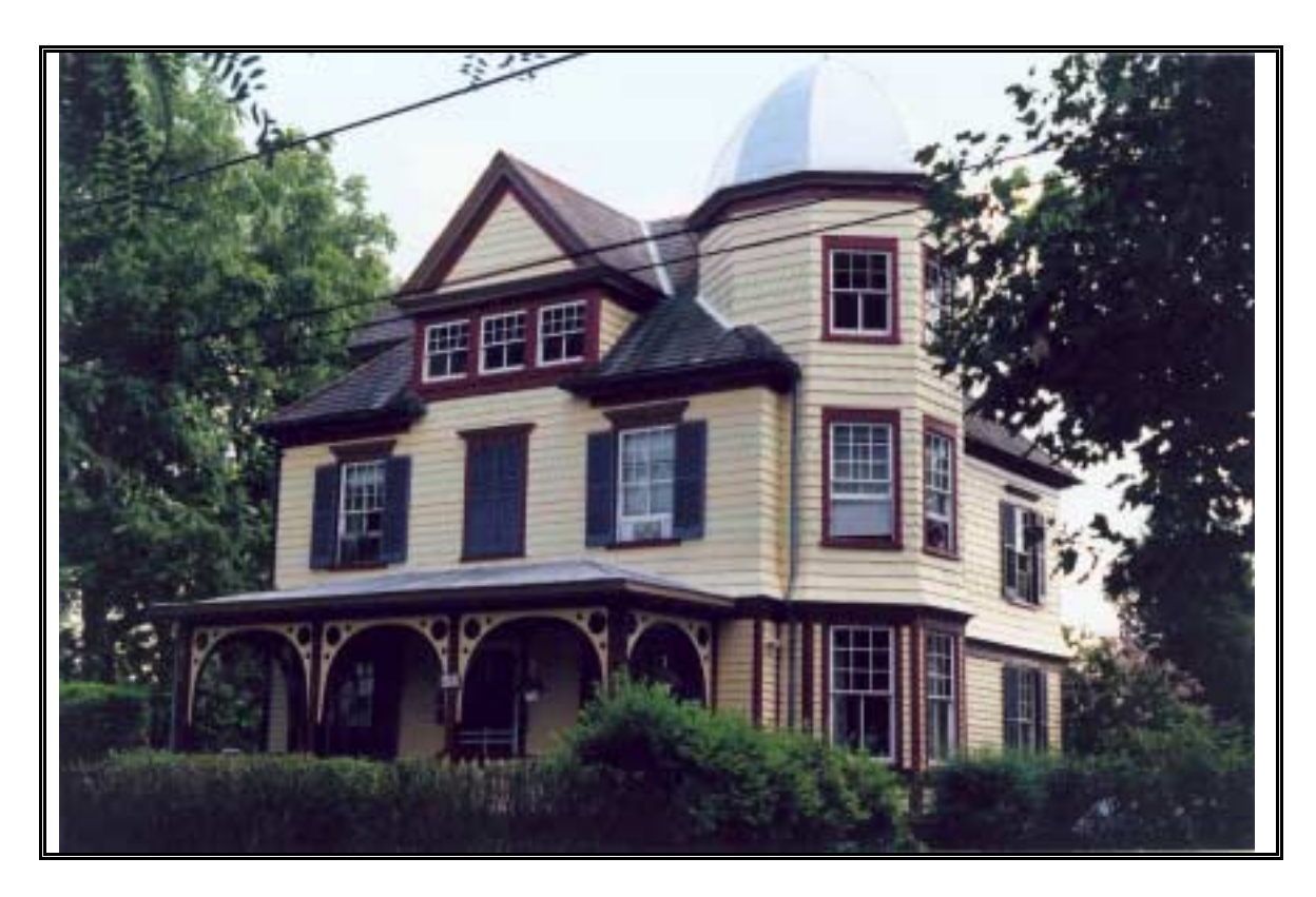
Plate 9: Queen Anne (4900 block of Oliver Street, Riverdale, Prince George's County)