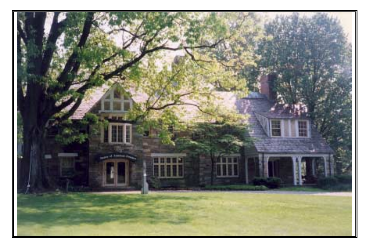
Plate 13: Tudor Revival (5400 Grosvenor Lane, Grosvenor, Montgomery County)