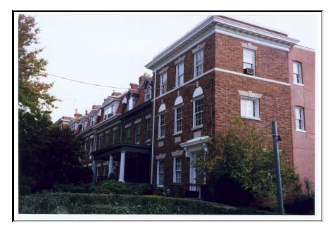
Plate 5: Row House (2900 block of Upton Street, Tenleytown, Washington, D.C.)