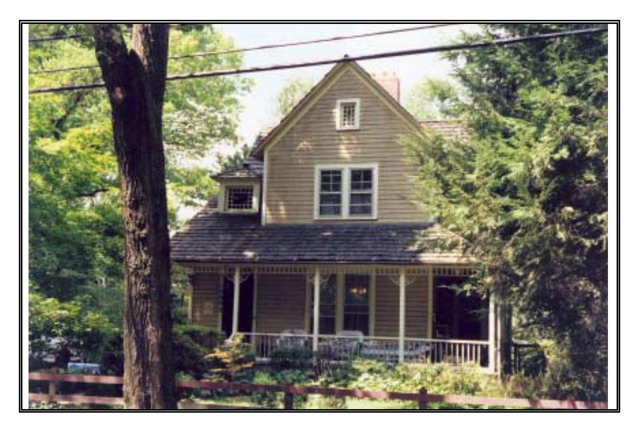
Plate 11: Folk Victorian (10802 Kenilworth Avenue, Garrett Park, Montgomery County)