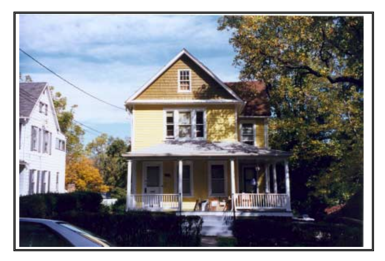
Plate 7: Vernacular Residence (404 Tulip Avenue, Takoma Park, Montgomery County)