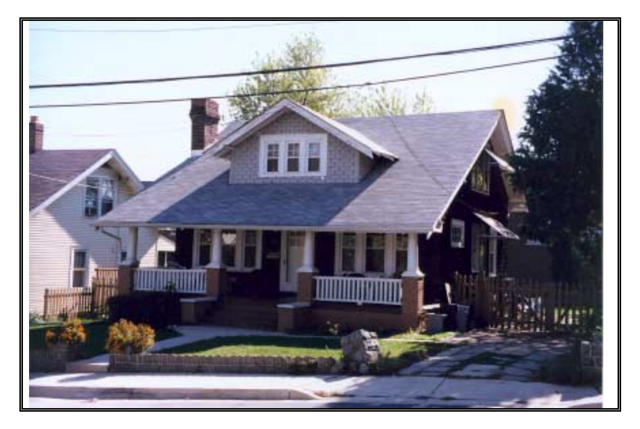
Plate 15: Bungalow (4400 block of Gallatin Street, Hyattsville, Prince George's County)