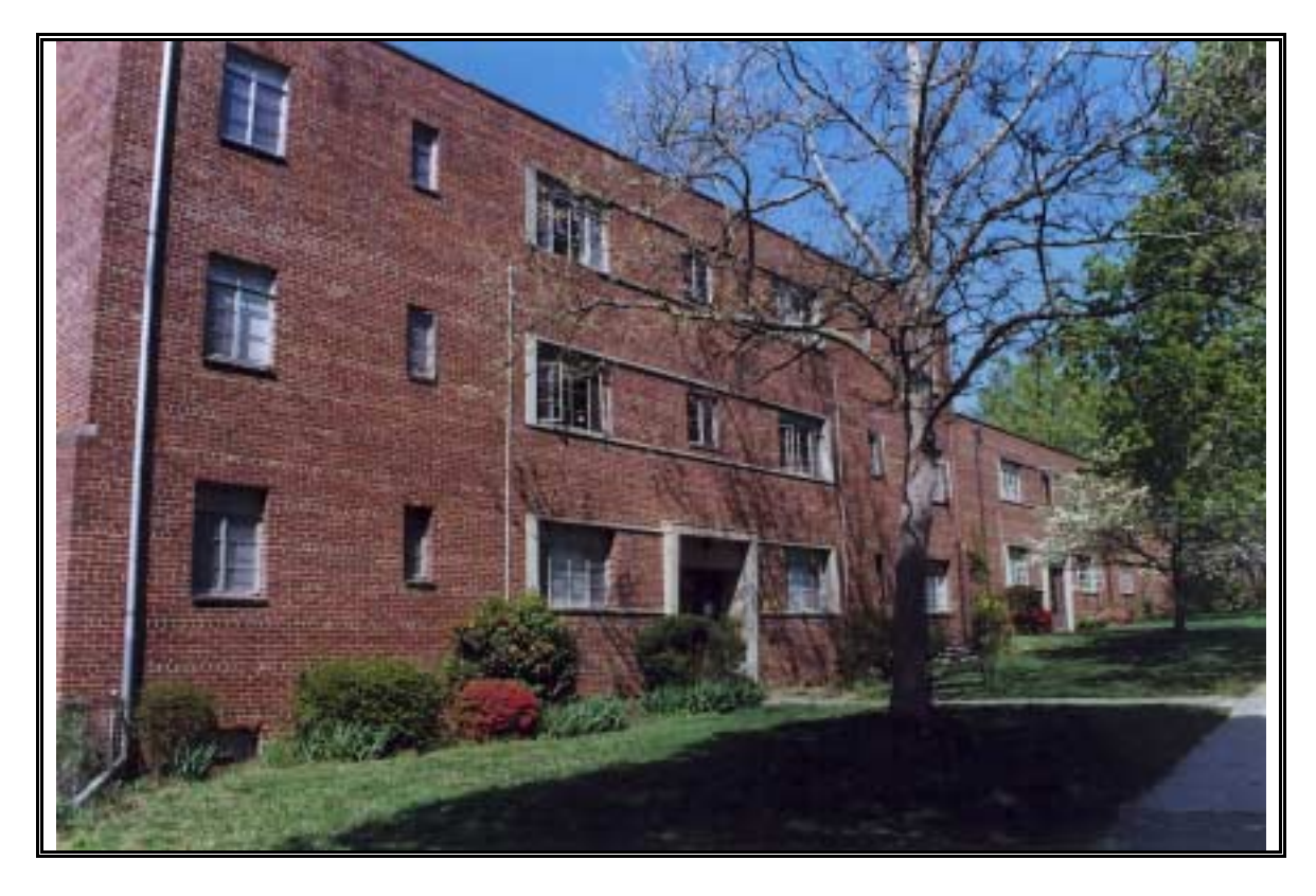
Plate 22: Apartment Building (Belvedere Apartments, 2105 Belvedere Boulevard, Forest Glen, Montgomery County)