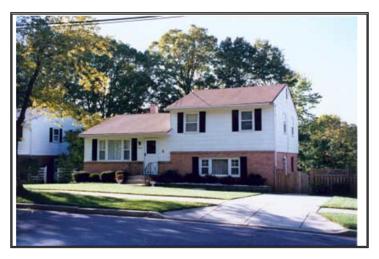
Plate 18: Split-level House (6816 Elbrook Road, Good Luck Estates, Prince George's County)