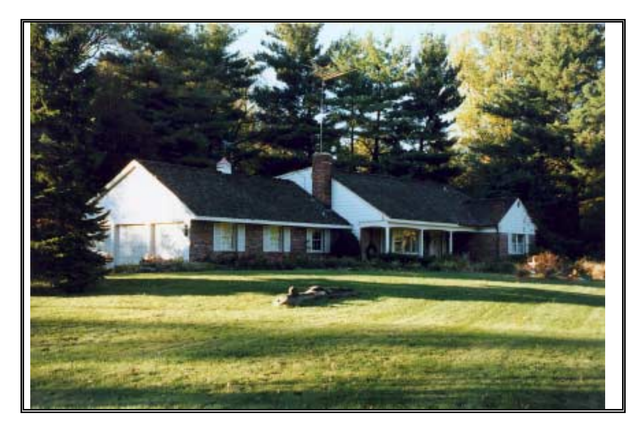
Plate 17: Ranch Dwelling (Burnt Mills Avenue, Burnt Mills, Montgomery County)