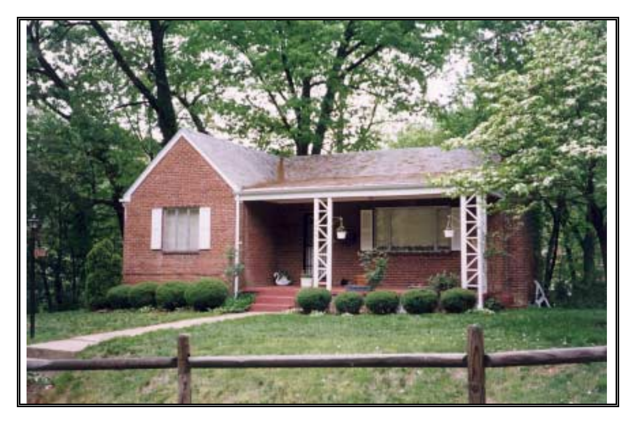
Plate 19: Minimal Traditional House (9800 Grayson Avenue, Four Corners, Montgomery County)