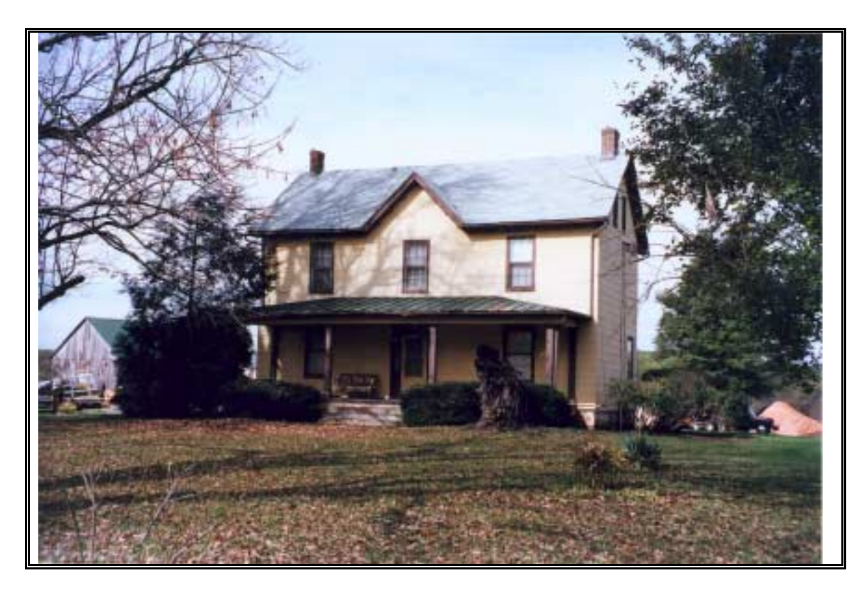
Plate 6: I-House (NW corner of Layhill Road and Norbeck Road, Norwood, Montgomery County)