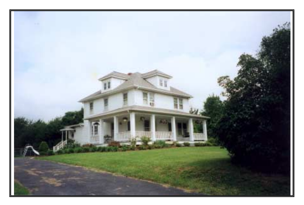
Plate 14: Four-Square (13808 Old Columbia Pike, Fairland, Montgomery County)