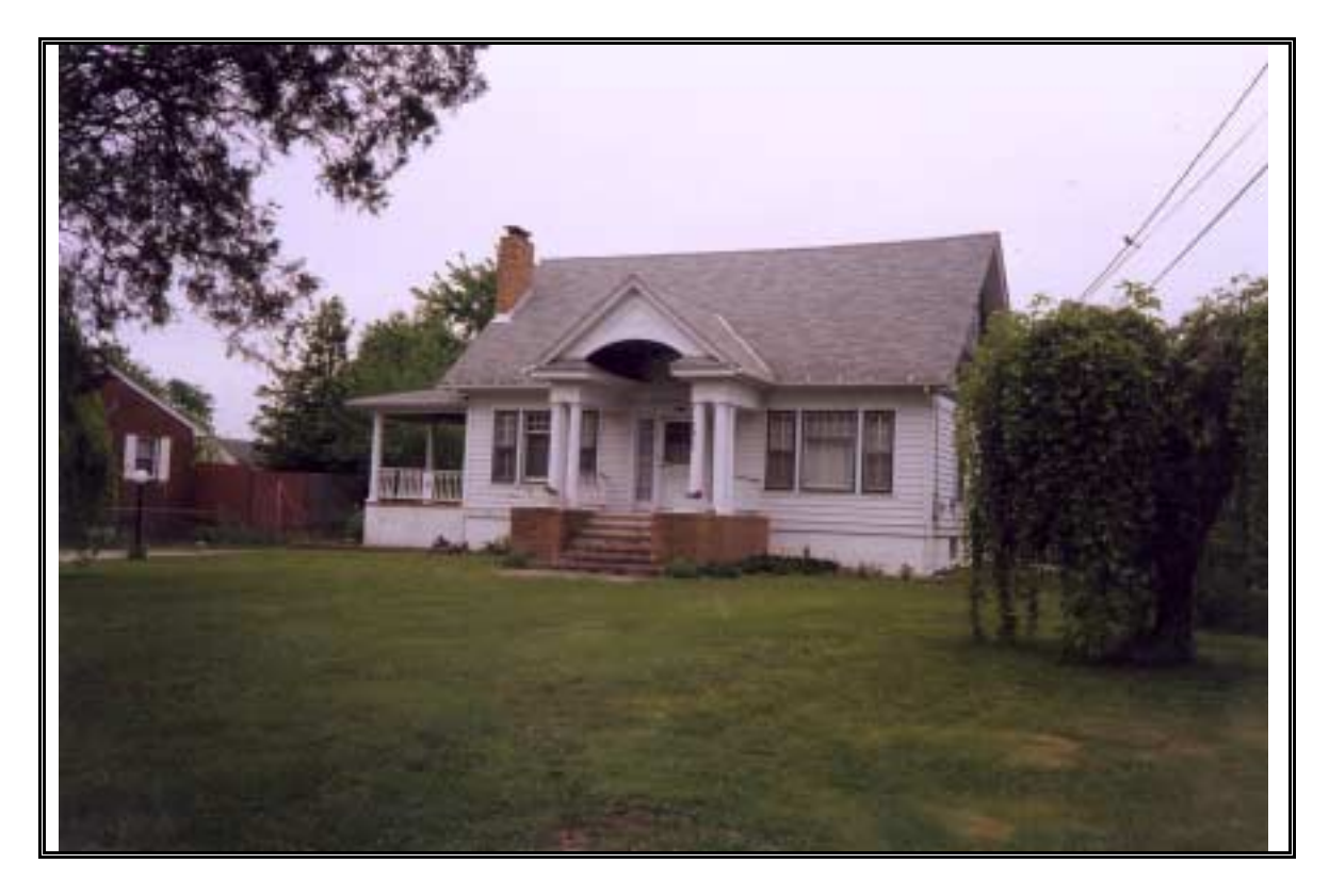
Plate 20: Mail-order House (7905 Marlboro Pike, Forestville, Prince George's County)