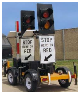
Figure 2. Red/Yellow lens AFAD (not permitted for use in Maryland)