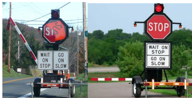
Figure 1. STOP/SLOW AFAD (permitted for use in Maryland)