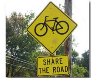
Bicycle Route & Share the Road signage