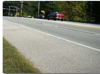
minimum four-foot-wide shoulder