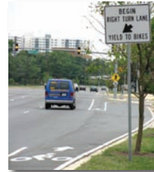
bicycle lane/pocket bike lane markings