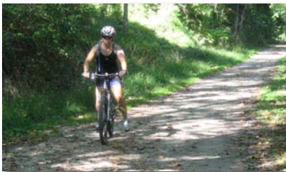
shared-use path (hiker/biker trail)