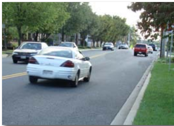
wide outside lane for bicycle compatibility