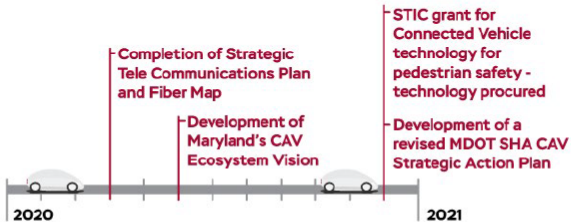
Figure 1: Estimated timeline of deliverables from the 2019 Accomplishments & The Road Ahead report

CAV initiatives are strongly supported by both MDOT SHA agency leadership and the internal CAV working group, which is comprised of over 50 MDOT SHA staff, consultants, and partners. The internal group meets bimonthly and is instrumental in aligning CAV initiatives across multiple offices for the cross collaboration of ideas and solutions. Each working group meeting provides updates and requests recommendations for future actions to ensure eventual adoption by all MDOT SHA offices and districts. At the end of each calendar year, this internal working group is asked to evaluate the CAV progress made at MDOT SHA that year. The responses are used to realign, as necessary, the following year's priorities, which in turn should advance the MDOT SHA 2021-2025 CAV Implementation Plan.