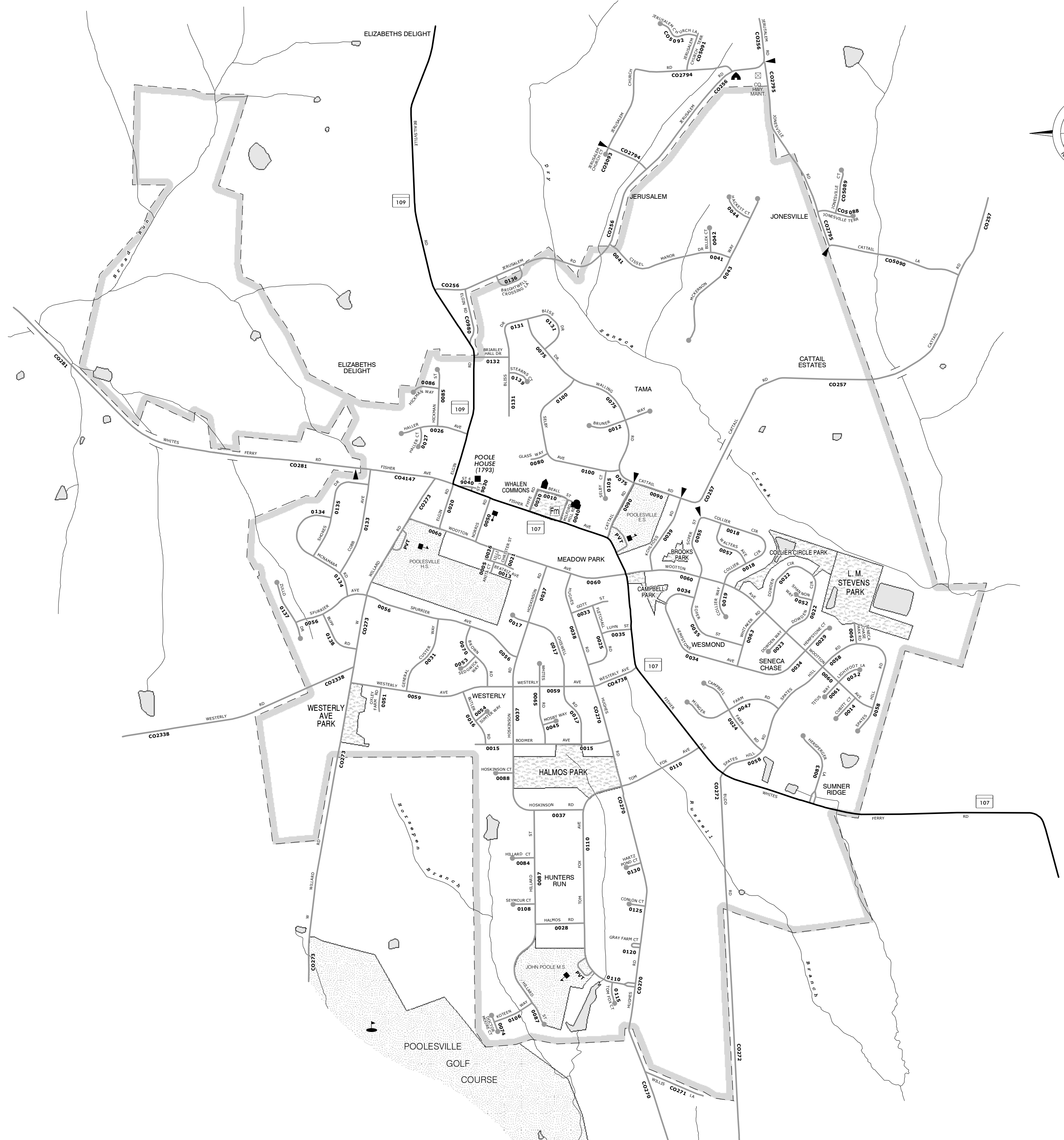
STATEWIDE QUARTER GRID MAP KEY