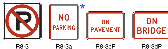
Figure 5B-2. Parking Signs and Plaques on Low-Volume Roads

* Sign shall not be used along State owned, operated and maintained roadways.