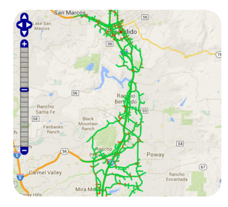
For the I-15 ICM in San Diego, Parson's developed monitors the parking supply in real-time at regional transit centers and disseminate this information to travelers via various traveler information systems, such as roadside changeable message signs (CMS), SANDAG's 511 services, web applications, and mobile phones.

With hundreds of ITS deployments and significant involvement in the assessment and planning for connected vehicles, we have the right background to help SHA assess, and plan for, a solution that provides the right balance and consideration for current needs and long term technology trends.